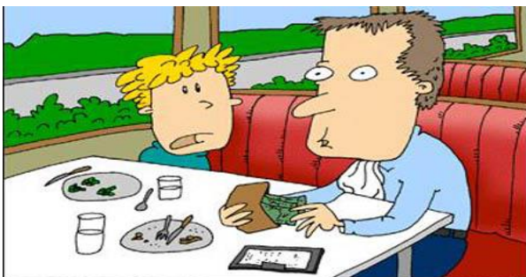
HOW COME THE WAITRESS GETS 15% AND GOD ONLY GETS 10%?